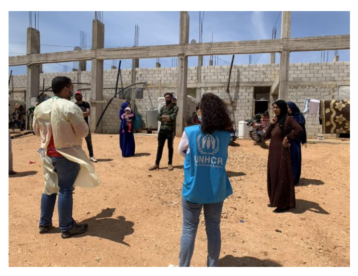
UNHCR and partners conduct COVID-19 awareness raising sessions with a refugee community in a collective shelter in the North.

UNHCR protection monitoring throughout 2020 indicated that the level of knowledge of refugees continued to improve on how to recognise COVID-19 symptoms, prevention measures as well as how to access information. The vast majority of surveyed refugees (93%) reported that they knew the COVID-19 symptoms and the precautionary measures to protect oneself against contracting the virus. Almost three quarters of respondents were aware of how and where to access PCR testing in case they or a family member suspected COVID-19. However, by November 2020, monitoring showed that a significant proportion of households were still not aware that costs for testing and treatment would be covered by UNHCR. Those respondents who indicated not to be aware, have been systematically contacted and informed by protection monitors on relevant information, preventive measures, and testing and treatment coverage by UNHCR whenever prescribed by the Ministry of Public Health.