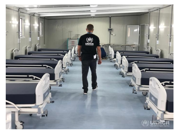
Additional COVID-19 ward at Halba Government Hospital.

"Were it not for the support of UNHCR with the bill, I would not have been able to afford any of this"